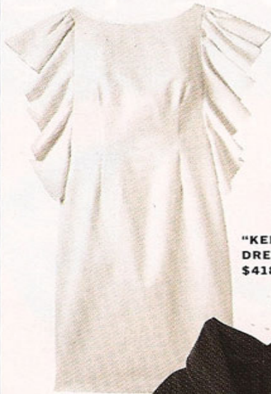
"KEIRA" DRESS, $418