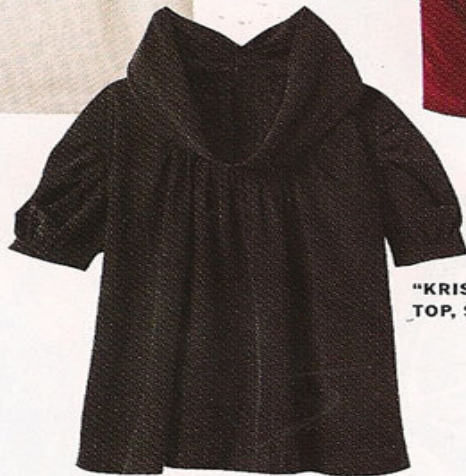
"KRISTIN" TOP, $215